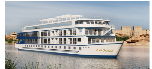
The stunning new AmaDahlia (rendering)