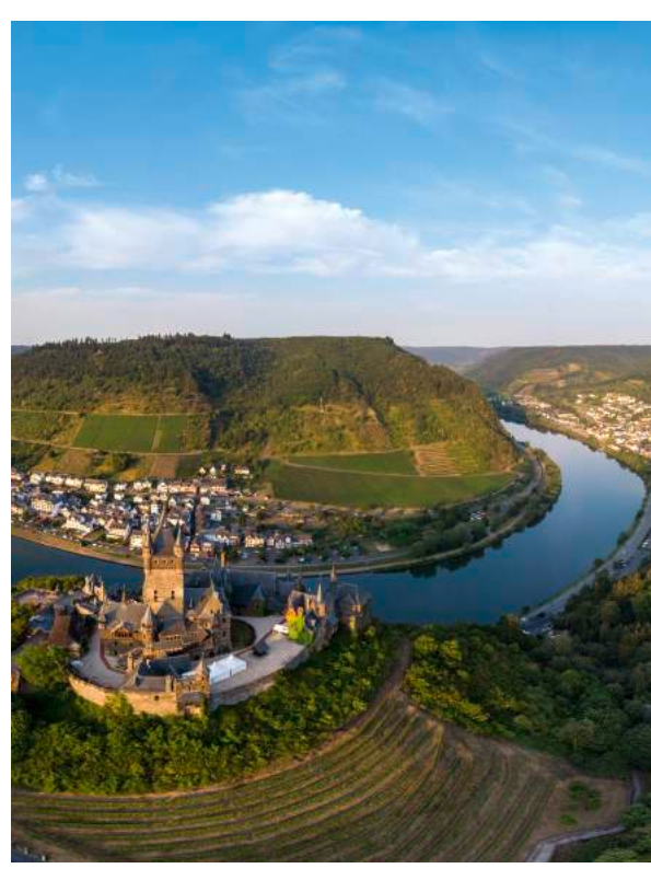
Cochem on the Moselle