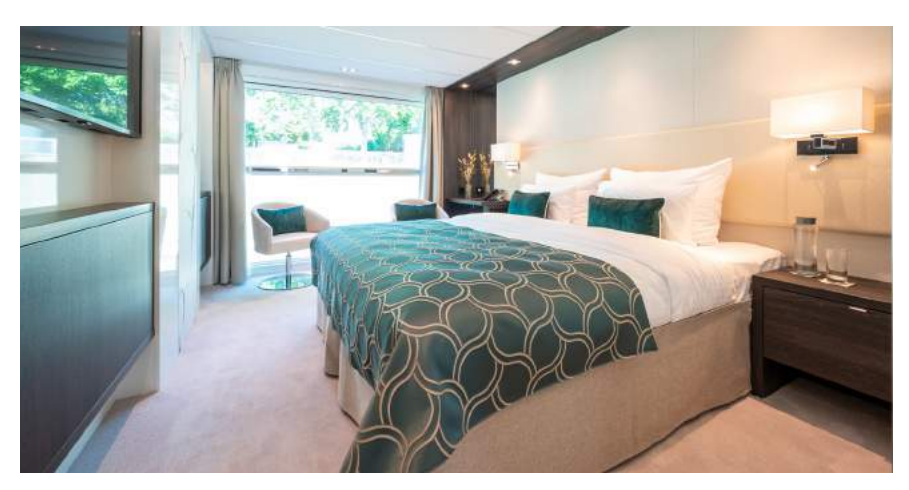
Stateroom onboard an AMADEUS vessel similar to the NEW AMADEUS Riva