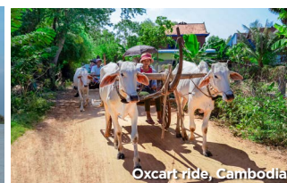
Oxcart ride, Cambodia