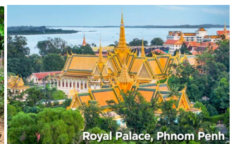
Royal Palace, Phnom Penh

BOOK BY JULY 31, 2021 AND SAVE $1,000 PER PERSON ON CRUISE FARE 7-NIGHT CRUISE ABOARD THE AMADARA