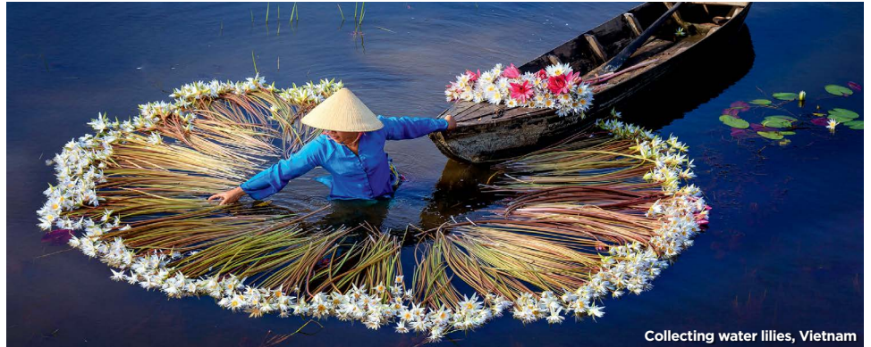
Collecting water lilies, Vietnam