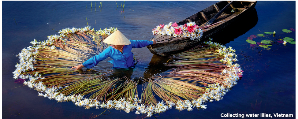
Collecting water lilies, Vietnam